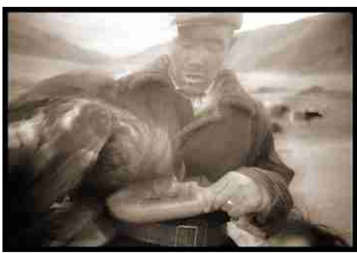
Howard Jones, Feeding Time, Archival Ink on Watercolor Paper 44x66.